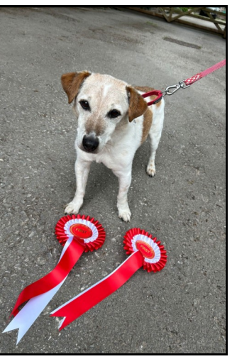
Patch and Rosettes